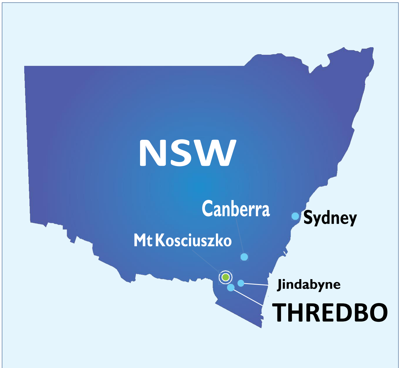
Figure 1 - Location of Thredbo Village.

Thredbo resort is located in the Southern Ranges region of New South Wales, occupying an area of 960ha within the southern portion of the Kosciuszko National Park, approximately 35km from Jindabyne (Figure 1). The resort area spans montane, sub-alpine and alpine bio-geographic regions ranging from 1,375m to 2,037m in altitude.